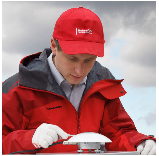
Figure 3 IR20 pyrgeometer being prepared for application.