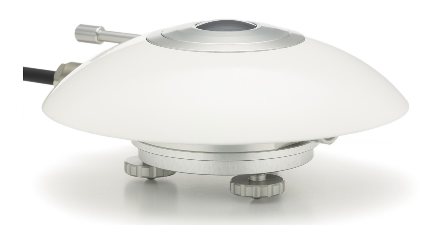
Figure 1 IR20 research grade pyrgeometer.

IR20 is a research grade pyrgeometer suitable for high-accuracy longwave irradiance measurement in meteorological applications. Thanks to Hukseflux' technological innovation, IR20 is offered at a significantly lower price level than competing models of the same performance level. IR20 is capable of measuring during both day and night. In absence of solar radiation, model IR20WS offers even better accuracy because of its wider spectral range.