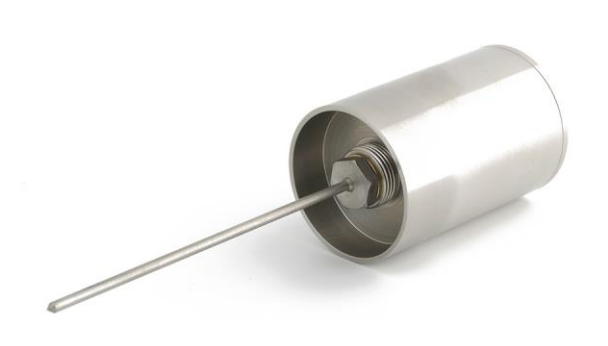
Figure 2 MTN02: Mounted on insertion tool IT03, the thermal needle TP07 is inserted into the soil.