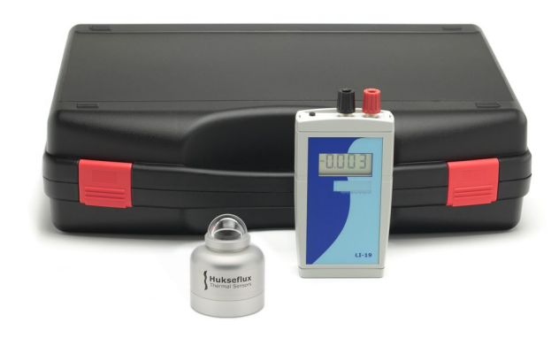
Figure 2 SR05-LI19 as it is delivered, in a practical transport case.