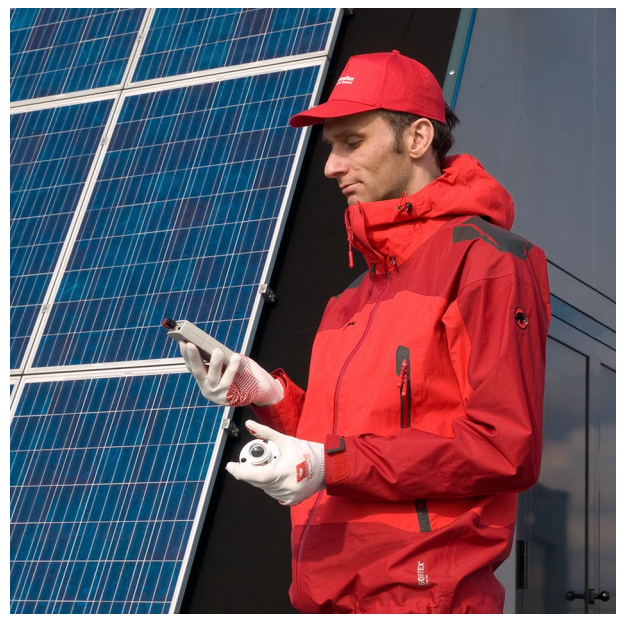
Figure 4 LI19 used with a pyranometer in a field measurement campaign.