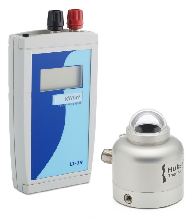
Figure 1 SR05-A1 pyranometer with LI19 handheld read-out unit / datalogger.

SR05 is a solar radiation sensor that is applied in most common solar radiation observations. SR05-A1, with analogue millivolt output, complies with the spectrally flat Class C specifications of the ISO 9060 standard and the WMO Guide. LI19 is a high-accuracy handheld read-out unit / datalogger. The SR05-LI19 combination is well suited for mobile measurements and short term datalogging.