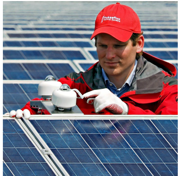
Figure 3 two SR30 secondary standard pyranometers with digital output for GHI (global horizontal irradiance) and POA (plane of array) measurement applications

The dome of SR30 pyranometer is heated by ventilating the area between the inner and outer dome. RVH™ is much more efficient than traditional ventilation, where most of the heat is carried away with the ventilation air. Recirculating ventilation is as effective in suppressing dew and frost deposition at 2 W as traditional ventilation is at 10 W. RVH™ technology also leads to a reduction of zero offsets.