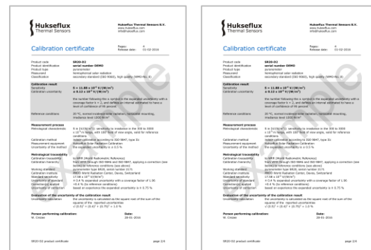
Figure 2 calibration certificate with each sensor documenting traceability and uncertainty evaluation