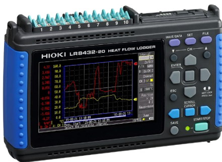
Figure 2 Hioki LR8432: can handle 5 heat flux sensors each with its own temperature measurement and display the measurement results simultaneously on screen.