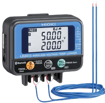
Figure 3 Hioki LR8515 can transmit measurements of 1 sensor and 1 thermocouple via Bluetooth.