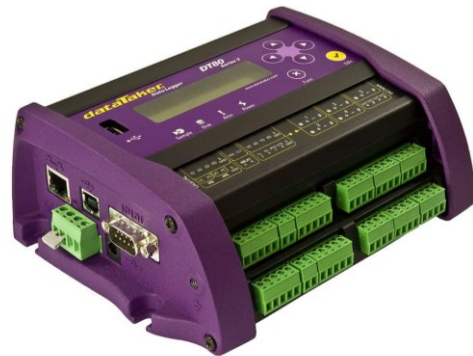
Figure 6 dataTaker: up to 15 sensor inputs, heat flux and thermocouples, USB memory for easy data and program transfers.

Interested in our products? E-mail us at: info@hukseflux.com