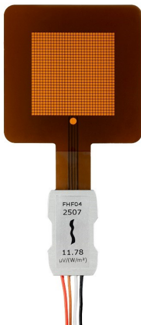
Figure 1 FHF04 foil heat flux sensor with thermal spreaders: thin, flexible and versatile.

This brochure shows a summary only, and does not show all sensor models and options. Also not all relevant electronics specifications are shown. Contact Hukseflux for a final check of your proposed solution.