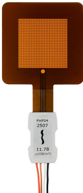
Figure 1 FHF04 foil heat flux sensor with thermal spreaders: thin, flexible and versatile

The combined measurement of heat flux and temperature offers you a full picture of the thermal behaviour of a system. Heat flux sensor output is a small millivolt signal. Often heat flux sensors are combined with thermocouples. We have several preferred solutions for amplification, data logging and data visualisation. This brochure shows a summary only, and does not show all sensor models and options. Also not all relevant electronics specifications are shown. Contact Hukseflux for a final check of your proposed solution.