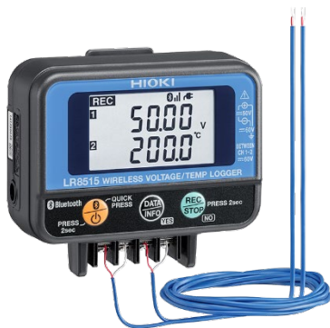
Figure 3 Hioki LR8515 can transmit measurements of 1 sensor and 1 thermocouple via Bluetooth