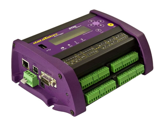
Figure 6 dataTaker: up to 15 sensor inputs, heat flux and thermocouples, USB memory for easy data and program transfers.