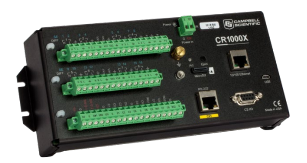
Figure 5 Campbell CR1000X: 8 differential sensor inputs, heat flux and thermocouples, Micro USB B connection, ethernet, MicroSD data storage expansion.

Heat flux + temperature sensors and loggers are used to analyse the causes of temperature change. Also, they are used to validate mathematical CFD simulations.