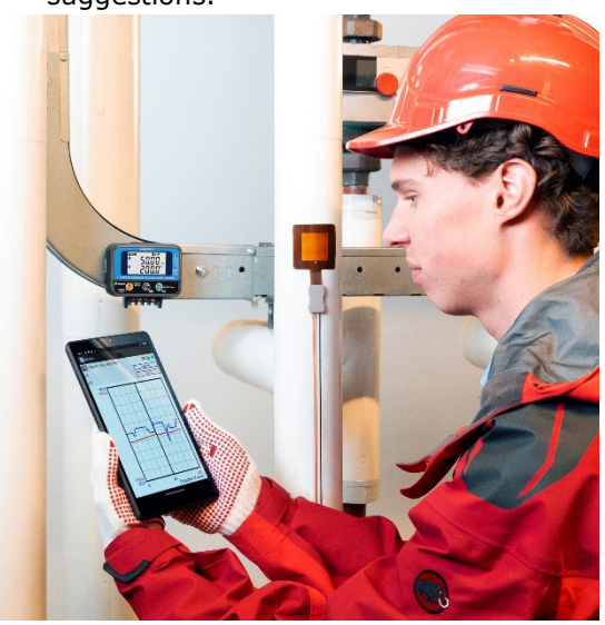
Figure 3 Hioki LR8515 can transmit measurements of 1 sensor and 1 thermocouple via Bluetooth.

send all information and specifications to Hukseflux, and ask for our input / suggestions.