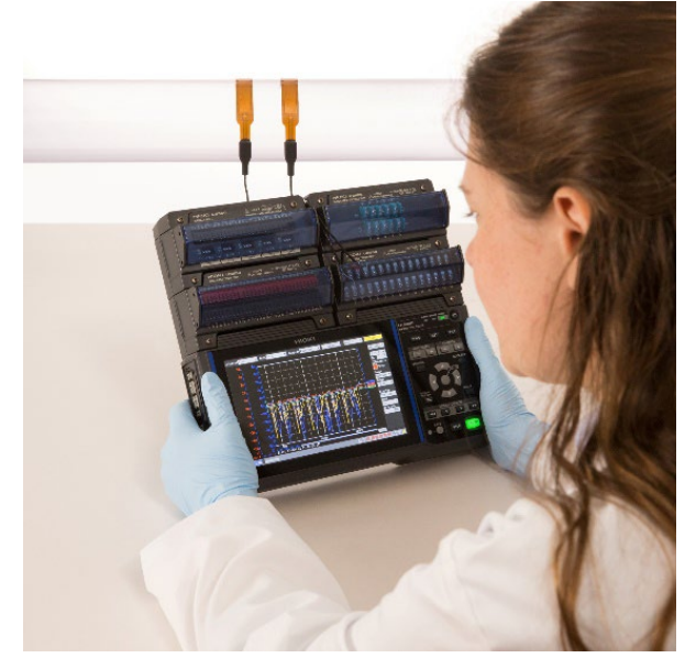
Figure 2 Hioki LR8450: can handle up to 120 heat flux sensors each with its own temperature measurement and display the measurement results simultaneously on screen.