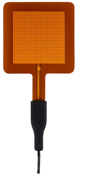
Figure 1 FHF05-50X50 foil heat flux sensor with thermal spreaders: thin, flexible and versatile.

The combined measurement of heat flux and temperature offers you a full picture of the thermal behaviour of a system. Heat flux sensor output is a small millivolt signal. Often heat flux sensors are combined with thermocouples. We have several preferred solutions for amplification, data logging and data visualisation. This brochure shows a summary only, and does not show all sensor models and options. Also not all relevant electronics specifications are shown. Contact Hukseflux for a final check of your proposed solution.