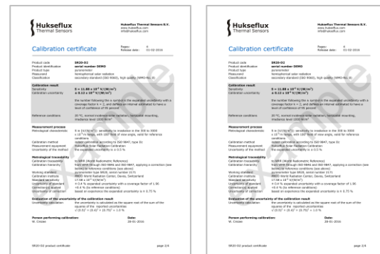
Figure 2 calibration certificate with each sensor documenting traceability and uncertainty evaluation