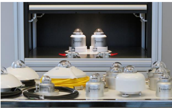
Figure 1 calibration of all major pyranometer brands

With its products or as part of calibration services, Hukseflux issues calibration certificates with content limited as per ISO / IEC 17025-7.8.1.3. Such a certificate contains the calibration result, an uncertainty, a description of the calibration procedure and the traceability. In case an earlier certificate is supplied with the instrument, we include a reference in our calibration certificate to this earlier certificate. As an option, a certificate including name and contact information of the customer may be ordered.