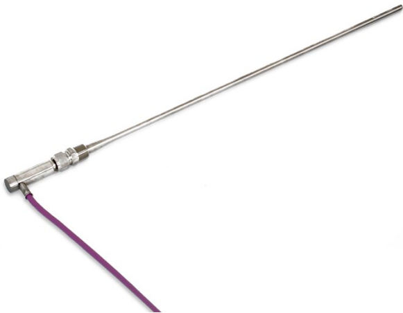
Figure 5 NF01 needle type heat flux and temperature sensor used in blast furnaces