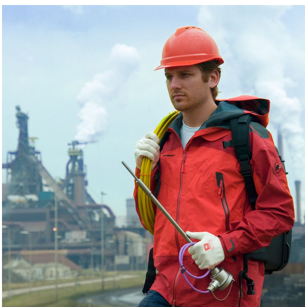
Figure 1 NF01 needle type heat flux sensor: improved process control and faster emergency response

Many industrial systems rely on temperature measurements. Heat flux measurements offer additional information. A change of temperature usually goes together with a heat flux. Measuring both quantities offers a better picture of what is happening. Heat flux can often be detected earlier than a temperature change. This offers advantages, for example better process control and faster response to emergency situations.