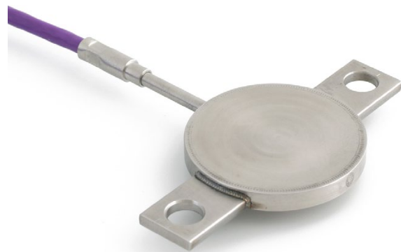
Figure 2 HF05 industrial heat flux sensor