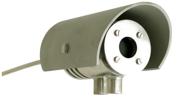
Figure 3 HF02 flare radiation monitor / heat flux sensor as used in permanent installation; EN (EExi) certified