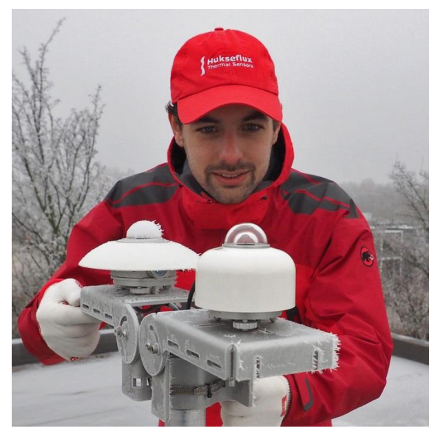
Figure 1 frost and dew deposition: clear difference between a non-heated pyranometer (back) and SR30 with RVH^{TM} -Recirculating Ventilation and Heating - technology (front)

IEC 61724-1:2017 requires pyranometer heating and ventilation for class A, and heating only for class B. Why? Pyranometer domes are made of glass. When facing the sky on a clear night, glass temperature tends to go below dewpoint, so that water condenses on the dome. Heating and ventilation of solar radiation sensors keeps the glass temperature above dewpoint and free from dew and frost deposition. This significantly increases the reliability of the measured data.