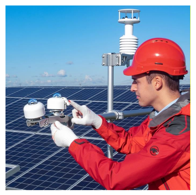
Figure 3 two SR30 secondary standard pyranometers with digital output for GHI (global horizontal irradiance) and POA (plane of array) measurement applications

RVH<sup>™</sup> uses SR30's built-in heater and ventilator. The dome of SR30 pyranometer is heated by ventilating the area between the inner and outer dome. RVH<sup>™</sup> is much more efficient than traditional ventilation, where most of the heat is carried away with the ventilation air. Recirculating ventilation is as effective in suppressing dew and frost deposition at 2 W as traditional ventilation is at 10 W. RVH<sup>™</sup> technology keeps domes and sensor in perfect thermal equilibrium, which also leads to a reduction of zero offsets.