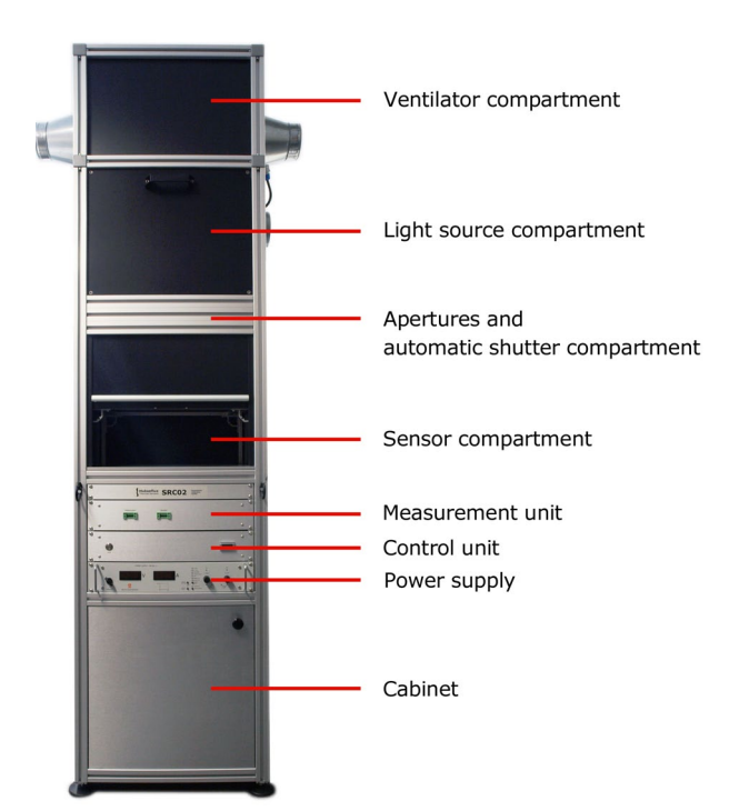
Figure 1 SRC02 indoor pyranometer calibration system

The leading pyranometer manufacturers and many others calibrate pyranometers indoors at normal incidence, according to the ISO 9847 and equivalent ASTM G 207 standards. Compared to outdoor calibration, the method has the fundamental advantage that directional response and temperature response are perfectly reproducible. It works under generally accepted reference conditions: 0 ° zenith angle is the reference for directional error and 20 °C is the reference instrument temperature.