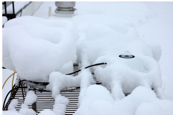
Figure 5 Does ventilation work to remove snow? Not reliably: this photo shows 3 ventilation units in FEB 2014 in Logan UT, USA powder snow. Only 1 of the 3 pyranometers, the one at the right (SR20 with VU01), is visible. The other 2 are still covered in snow.

Maintenance schedule as described in chapter 6, recommends instrument cleaning as well as checks of the ventilator once per day, lubrication or cleaning of ventilators every year.