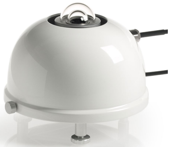
Figure 3 Traditional external VU01 ventilation unit with pyranometer SR20