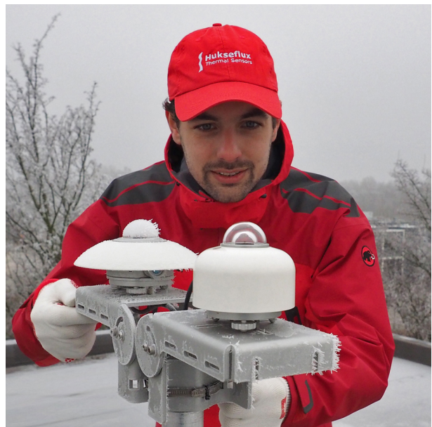
Figure 1 A typical problem in freezing conditions: ice accumulation on the pyranometer dome surface reduces data availability. At the front, a new pyranometer design with recirculating ventilation.