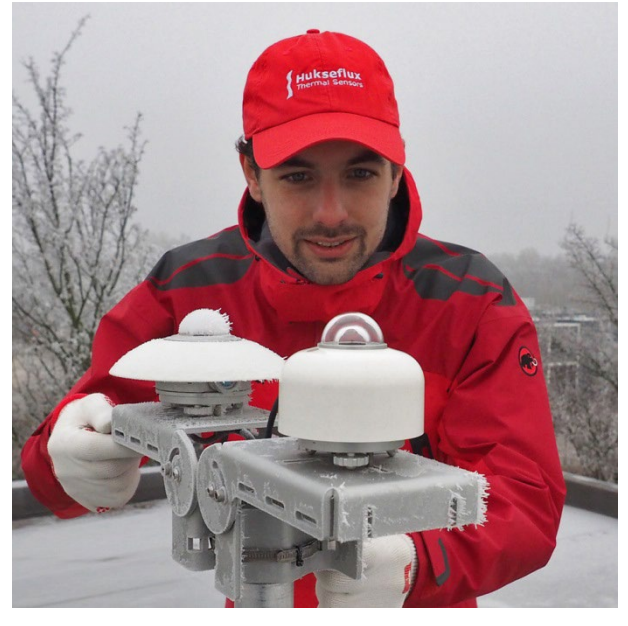
Figure 3 Frost and dew deposition: clear difference between a non-heated pyranometer (back) and SR30 with RVH^{TM} technology (front).