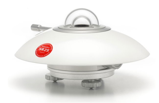
Figure 2 Example of a Hukseflux spectrally flat Class A pyranometer, model SR25, with a sapphire outer dome. This model is recommended for research grade diffuse radiation measurement. Output is either analogue millivolt or digital via Modbus RTU over RS-485 and analogue 4-20 mA (current loop).