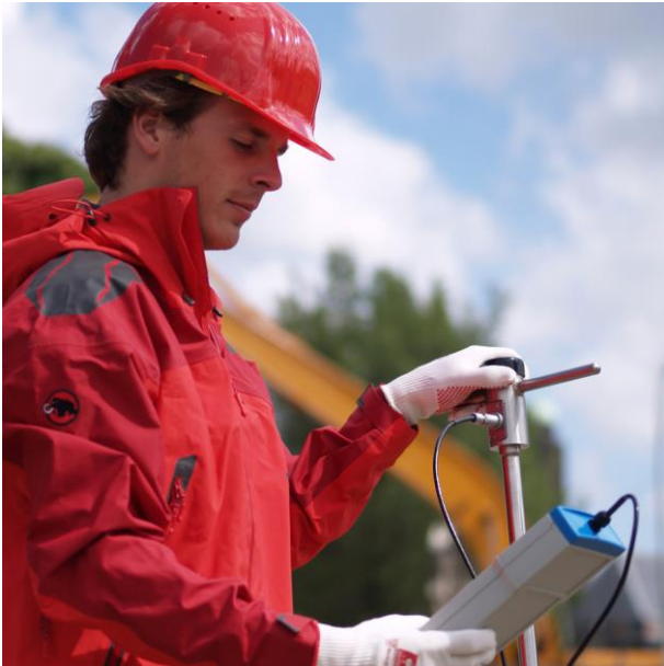
Figure 1 Example of an application of Hukseflux thermal conductivity measuring systems: thermal route survey

Hukseflux is a leading manufacturer of thermal conductivity measuring systems and sensors. This brochure offers general guidelines for choosing the right system or sensor for your application. Cannot find what you are looking for? Ask us for alternatives. Hukseflux also offers material characterisation testing services.