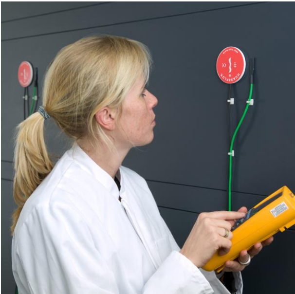
Figure 4 TRSYS01 system in use for building envelope thermal resistance measurement