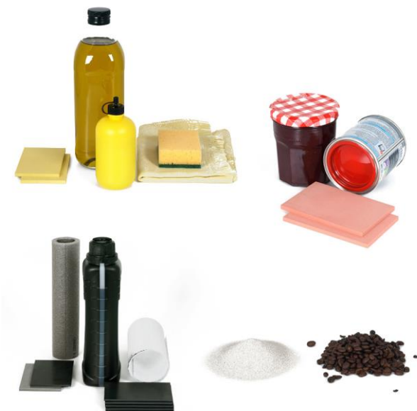
Figure 2 Example of materials of which thermal properties can be determined with Hukseflux measuring systems and sensors: common samples are plastics, paints, composites, pastes and fluids

Hukseflux is able to offer highest quality products at an acceptable price level. If we cannot offer you an acceptable solution ourselves, we will tell you who can. Please contact us for further assistance.