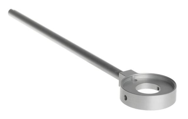
Figure 1 AMF02 or AMF03 albedometer kits are used to mount both an up- and a downfacing pyranometer, and construct an albedometer. The image shows the AMF02 mounting fixture and its rod. A glare screen for the downfacing sensor is also included.

Hukseflux offers a full range of dedicated, ready-to-use albedometers for measuring albedo. Alternatively, with the AMF03 or AMF02 mounting fixture in AMF / ALF series, you may choose to construct albedometers from popular Hukseflux pyranometers yourself. AMF03, AMF02 and SRA series albedometers can be levelled with ALF01 levelling fixture.