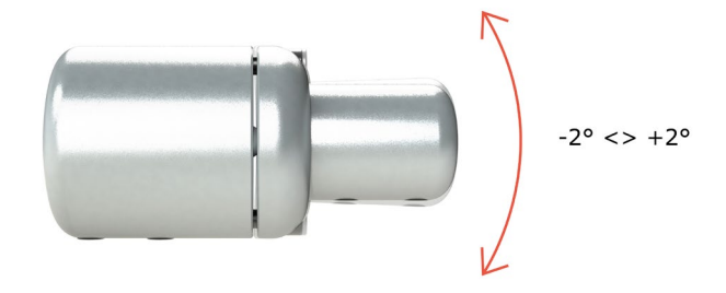
Figure 2 ALF01 albedometer levelling tool, can be rotated around the axis of the crossarm to which it is connected, and tilted over \pm 2 °.