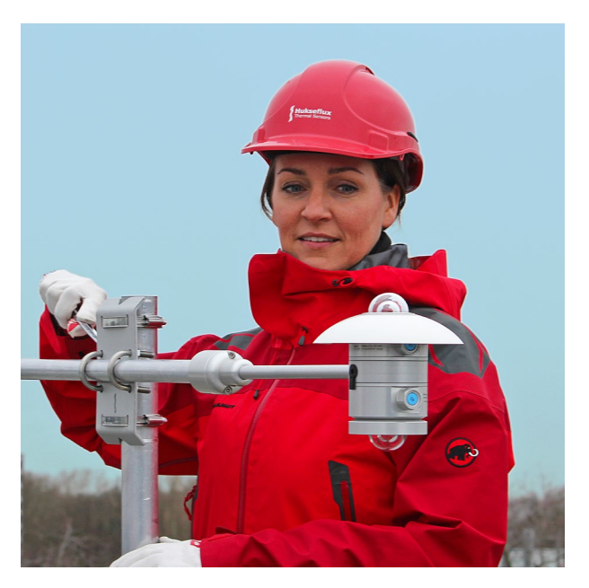
Figure 6 Installation of AMF02 albedometer mounting kit and two SR20 pyranometers, mounted with ALF01 levelling fixture on a crossarm with crossarm bracket CMF01.