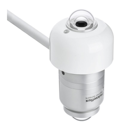
Figure 5 The end result using AMF03 and two SR30-M2-D1 pyranometers: SRA30-M2-D1 albedometer.