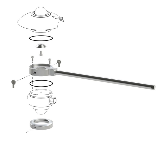
Figure 3 Clear instructions are included with AMF series.