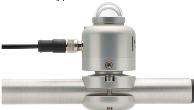
Figure 5 Complementary mounting options.

There are other Hukseflux mounting options available for SR30, SR15 and SR05 pyranometers. They allow for simplified mounting, levelling and instrument exchange on a flat surface or a tube, such as a crossarm. These mounts are optional with the purchase of these instruments. Alternatively, PMF01 and PMF02 brackets may be used for mounting any Hukseflux pyranometer on a mast, crossarm or other mounting platform.