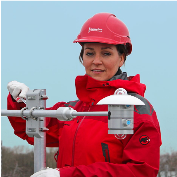
Figure 4 An albedometer being installed with its rod mounted securely to a mast thanks to ALF01 levelling fixture and CMF01 crossarm mounting fixture.

CMF01 is made of high-quality metals, allowing installations in all climates and weather conditions. It is delivered with u-bolts and tube clamps. The user should provide his own crossarm and instrument(s). The latter can be ordered separately at Hukseflux.