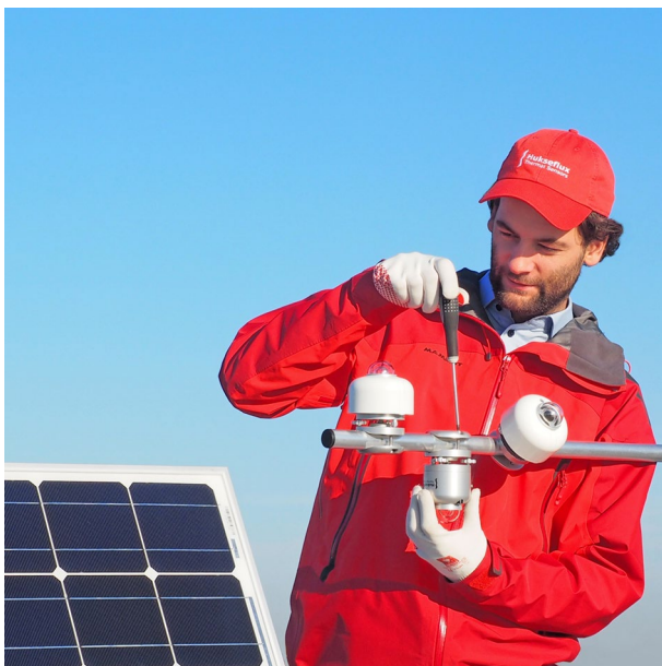
Figure 2 A crossarm can be used for easy installation of a pyranometer, in this case SR30, in Plane of Array, horizontal or inverted for PV system performance monitoring.