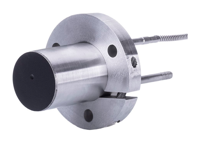
Figure 1 HFS01 high heat flux sensor, water cooled