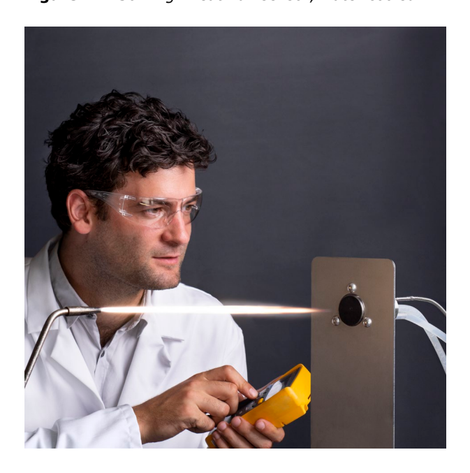
Figure 2 HFS01 is the sensor of choice for studies of concentrated sun and high-intensity flames