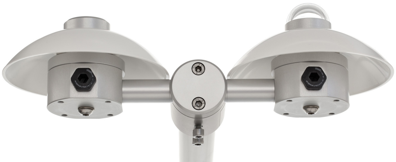
Figure 1 RA01 2-component radiometer

RA01 is a market leading 2-component radiometer, mostly used in scientific-grade energy balance and surface flux studies. It offers 2 separate measurements of solar and longwave radiation. Product features include a modular design, low weight, and easy levelling, and low solar offsets in the longwave measurement. The unique capability to heat the pyrgeometer reduces measurement errors caused by dew deposition. When combined with estimates of solar albedo and of local surface temperature, this instrument can also be used for estimation of net radiation. The advantages of this approach are cost reduction and independence from local surface properties.