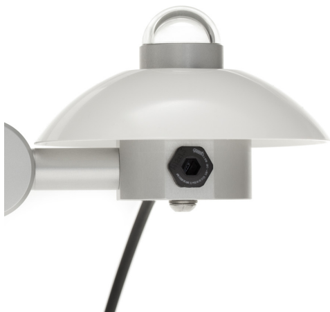
Figure 4 RA01 2-component radiometer in detail: pyranometer model SR01

Applicable instrument-classification standards are ISO 9060 and WMO-No.-8; Guide to Meteorological Instruments and Methods of Observation.