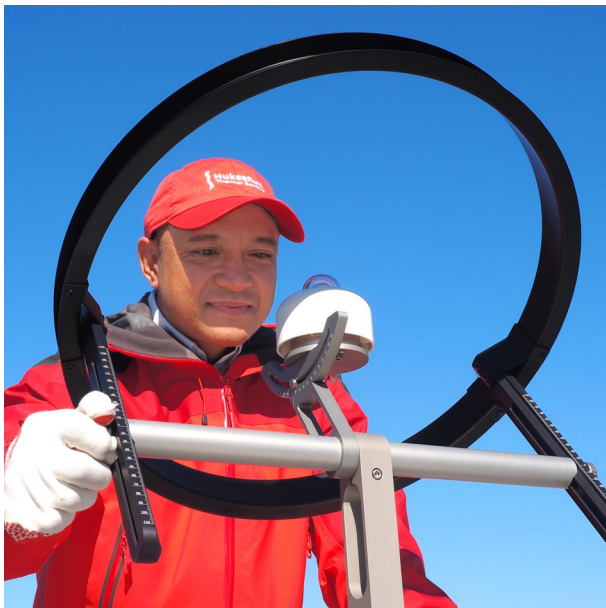
Figure 2 Installation of the compact SHR02 shadow ring and a Hukseflux pyranometer is easy. When combined, a diffusometer is created, in which the shaded pyranometer measures diffuse radiation only.