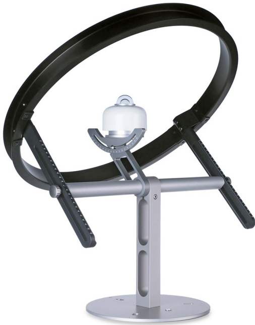
Figure 1 SHR02 shadow ring for pyranometers (a pyranometer is not included in SHR02 delivery).

SHR02 is a shadow ring, used in combination with a pyranometer to form a "diffusometer". The ring will prevent direct radiation from reaching the pyranometer from sunrise to sunset, so that the shaded pyranometer measures diffuse radiation only. SHR02 is used with Hukseflux pyranometers such as SR30, SR25 and SR20. These models have very low zero offsets, leading to higher accuracy diffuse measurements than attained with competing models.