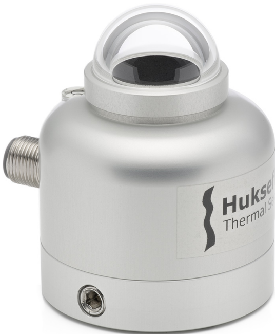
Figure 1 SR05-D1A3-PV pyranometer

SR05 series is the most affordable range of pyranometers meeting ISO 9060 requirements. These sensors are ideal for general solar radiation measurements and popular for monitoring PV systems. Model SR05-D1A3-PV is made as a perfect alternative to PV reference cells. It offers the same Modbus interface as the most common PV reference cell model for easy compatibility. Relative to PV reference cells, SR05-D1A3-PV has the advantage of higher stability, independence of the PV cell type or anti-reflection coating, and better availability and price of recalibration.