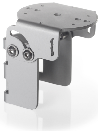
Figure 5 PMF01 mounting fixture accessory: practical, small footprint, and allowing horizontal and plane of array installations on various platforms