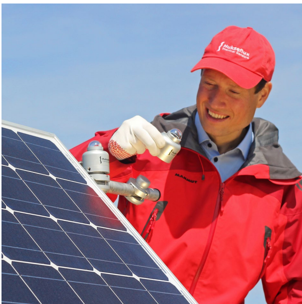
Figure 2 SR05's, one in PoA, replacing PV reference cells