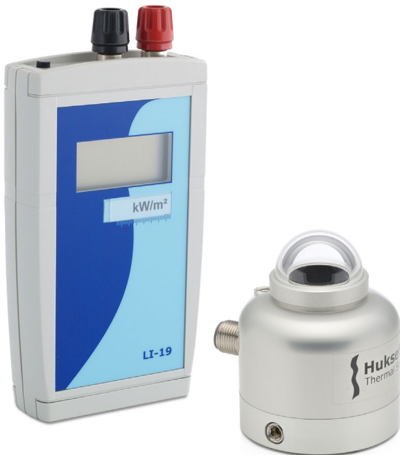
Figure 1 SR05-A1 pyranometer with LI19 handheld read-out unit / datalogger.

SR05 is a solar radiation sensor that is applied in most common solar radiation observations. SR05-A1, with analogue millivolt output, complies with the spectrally flat Class C specifications of the ISO 9060 standard and the WMO Guide. LI19 is a high-accuracy handheld read-out unit / datalogger. The SR05-LI19 combination is well suited for mobile measurements and short term datalogging.