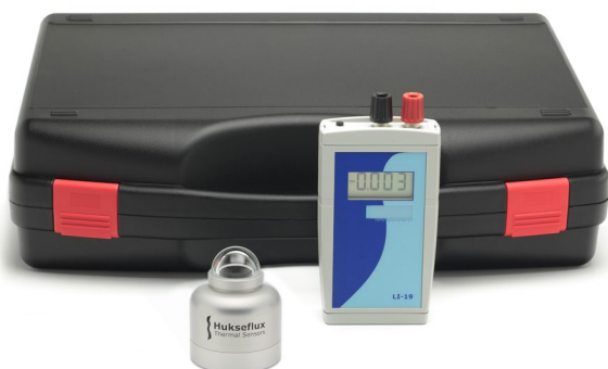
Figure 2 SR05-LI19 as it is delivered, in a practical transport case.