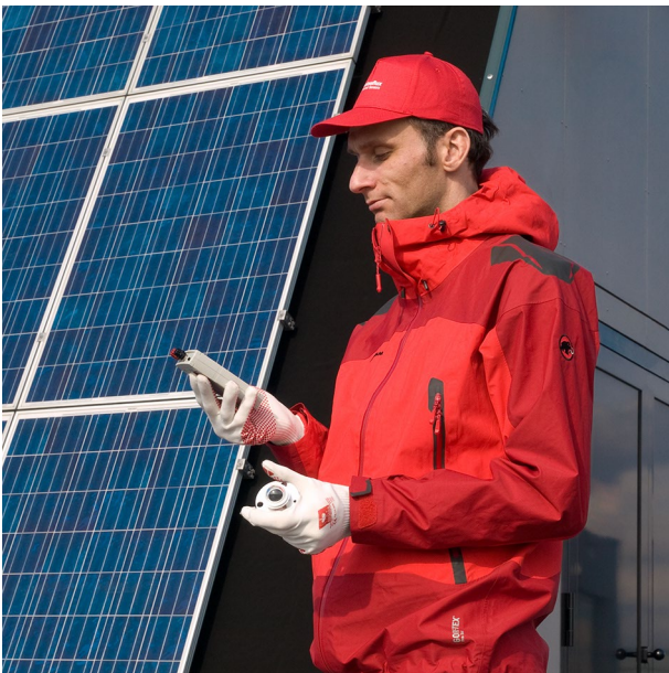
Figure 4 LI19 used with a pyranometer in a field measurement campaign.