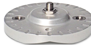
Figure 6 Several mounting options are offered, such as this spring-loaded levelling mount for easy mounting, levelling and instrument exchanges on flat surfaces.