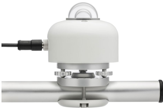
Figure 7 SR15 with optional tube levelling mount.