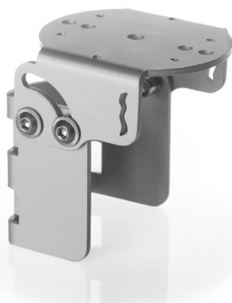
Figure 4 PMF01 mounting fixture accessory: practical, small footprint, and allowing horizontal and Plane of Array installations on various platforms.

WMO, the World Meteorological Organization, recommends use of Class B (first class) pyranometers such as SR15 for network operation.