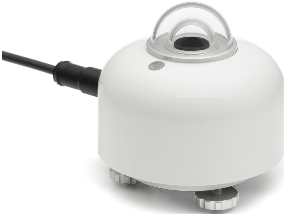
Figure 1 SR15 spectrally flat Class B pyranometer series.

SR15 pyranometer series is a range of high-accuracy solar radiation sensors. It is "spectrally flat Class B", according to the ISO 9060:2018 standard. Various outputs are available, both digital and analogue. Versions SR15-D1 and SR15-A1 are equipped with an on-board heater, mitigating dew and frost.