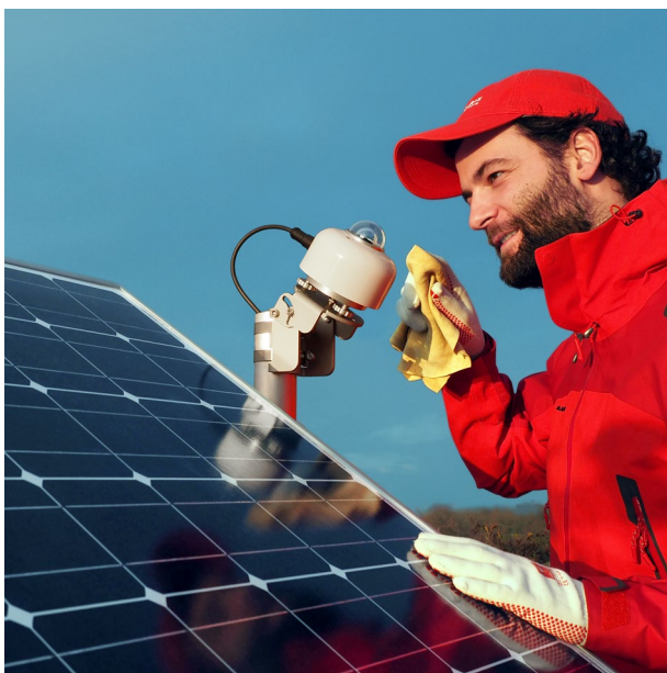
Figure 2 SR15 pyranometer mounted in POA (Plane of Array) on a mast for PV performance monitoring.