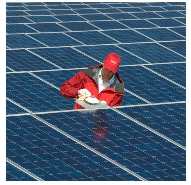
Figure 2 accurate PV system performance monitoring