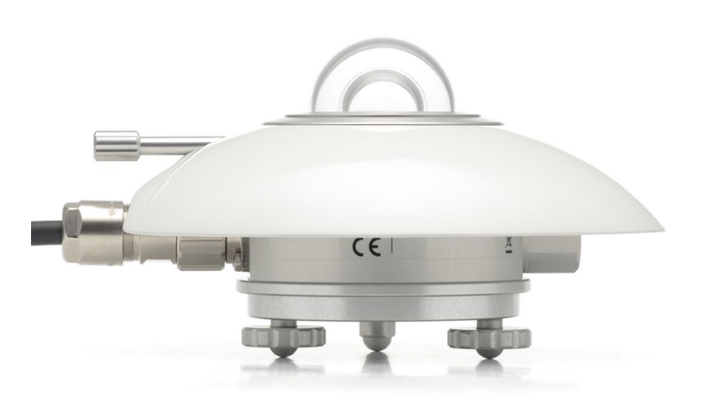
Figure 1 SR20 secondary standard pyranometer