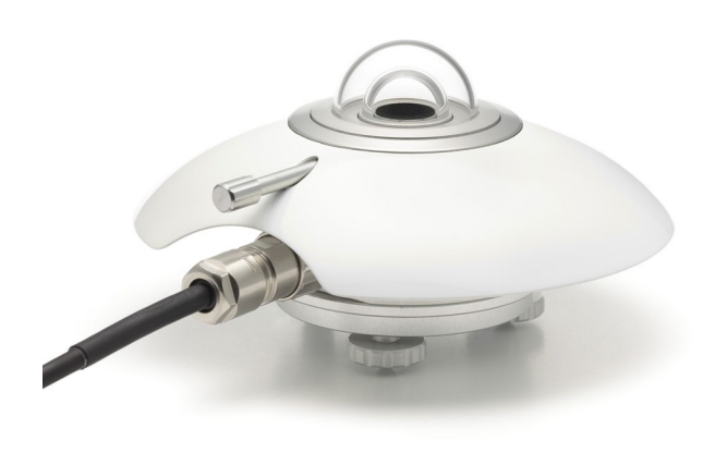
Figure 6 SR20 pyranometer side view

SR20's low temperature dependence makes it an ideal candidate for use under very cold and very hot conditions. The temperature dependence of every individual instrument is tested and supplied as a second degree polynomial. This information can be used for further reduction of temperature dependence during post-processing.