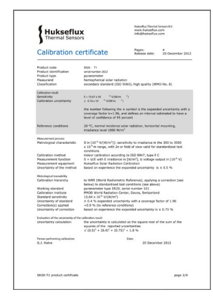
Figure 4 Hukseflux product and calibration certificates