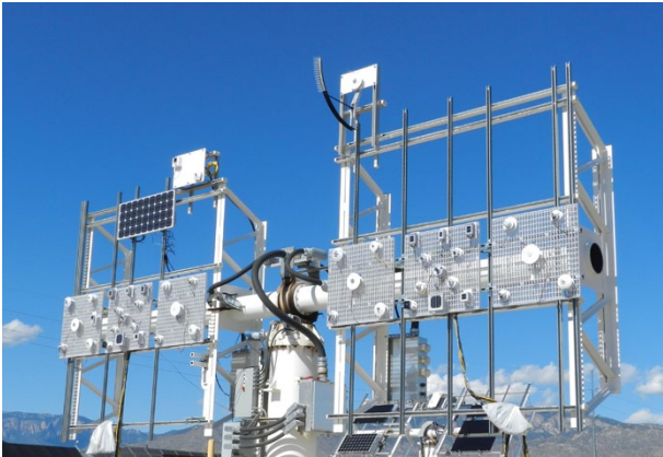
Figure 1 The 2-axis tracking facility at Sandia National Laboratories

Hukseflux is proud to notice pyranometer model SR20's performance during independent testing by PV Performance Labs (a consultant to the PV industry) supported by the European Commission Joint Research Centre's European Solar Test Installation and the US Department of Energy's Sandia National Laboratories.