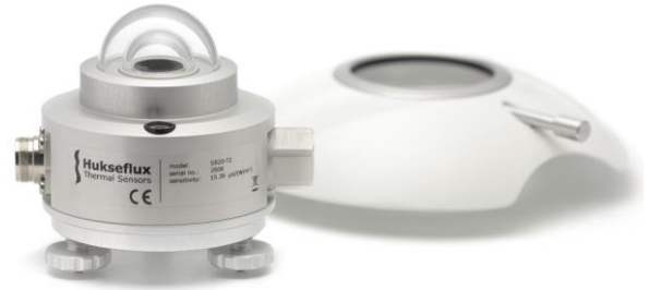
Figure 4 SR20 with its sun screen removed

The uncertainty of a measurement under outdoor conditions depends on many factors. Guidelines for uncertainty evaluation according to the "Guide to Expression of Uncertainty in Measurement" (GUM) can be found in our manuals. We provide spreadsheets to assist in the process of uncertainty evaluation of your measurement.