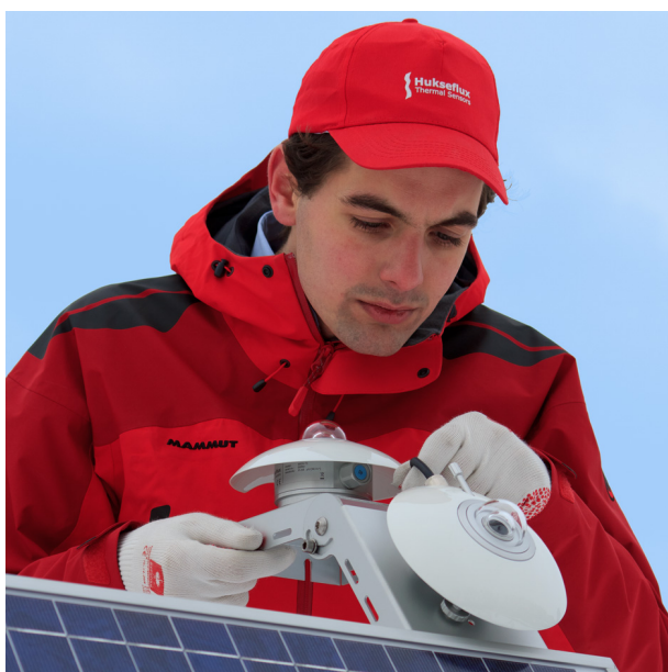
Figure 2 dual setup in PV system performance monitoring