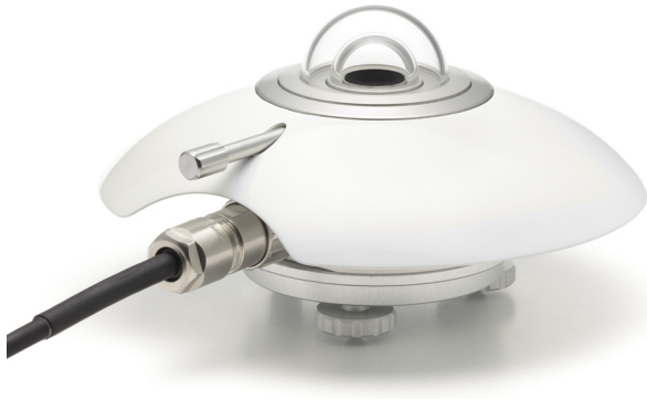
Figure 5 SR20 side view