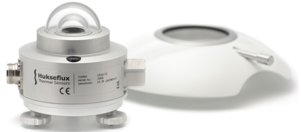
Figure 4 SR20 with its sun screen removed

The uncertainty of a measurement under outdoor conditions depends on many factors. Guidelines for uncertainty evaluation according to the "Guide to Expression of Uncertainty in Measurement" (GUM) can be found in our manuals. We provide spreadsheets to assist in the process of uncertainty evaluation of your measurement.