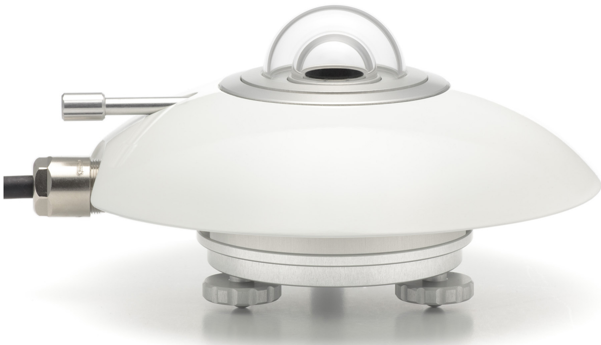
Figure 1 SR20 secondary standard pyranometer

SR20 is a solar radiation sensor of the highest category in the ISO 9060 classification system: secondary standard. SR20 pyranometer should be used where the highest measurement accuracy is required.