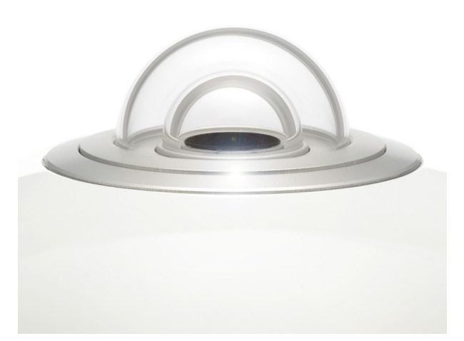
Figure 4 The inner and outer quartz domes of SR22 allow users to utilise SR22's extended spectral range.

Applicable instrument classification standards are ISO 9060 and WMO-No. 8. Included in delivery as required by ISO 9060: test certificates for temperature response and directional response. Calibration is according to ISO 9847. PV related standards are IEC 61724 and ASTM E2848.