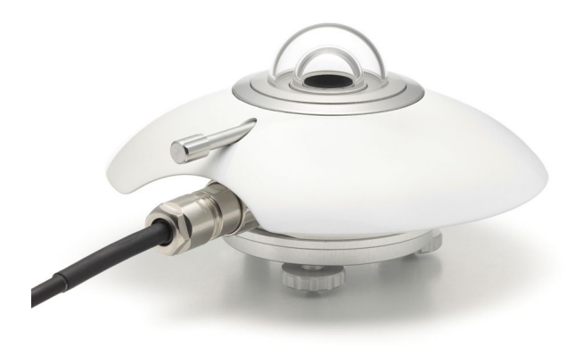
Figure 5 SR22 side view.