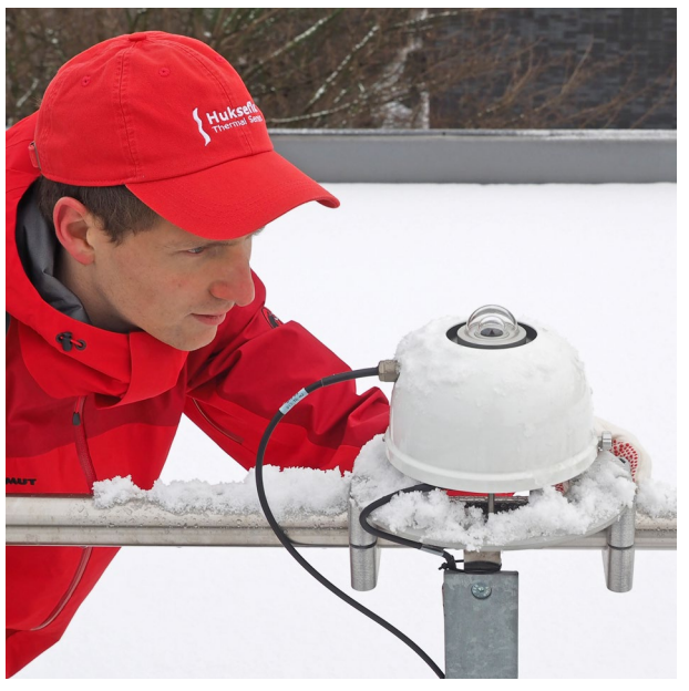
Figure 2 SR22 sensor combined with VU01 ventilation unit.