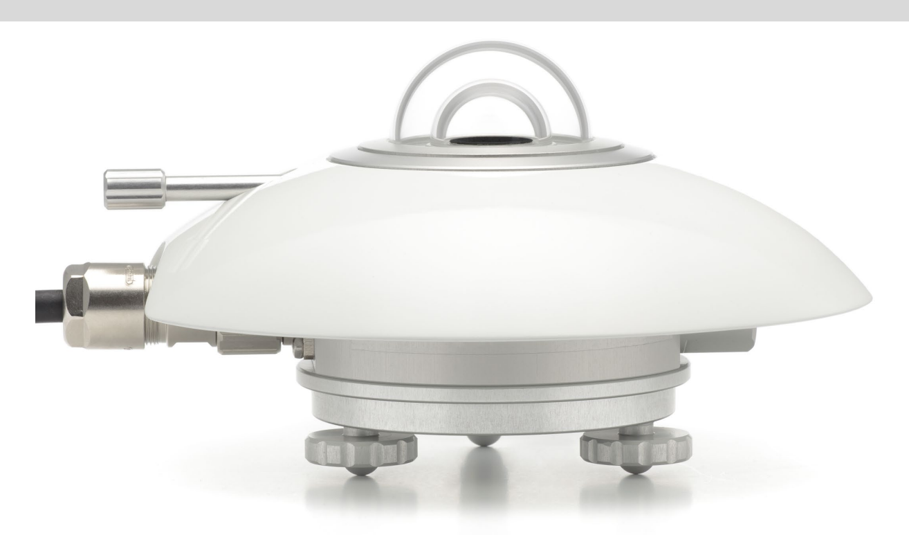
Figure 1 SR22 Class A pyranometer.

SR22 is a solar radiation sensor of the highest category in the ISO 9060 classification system: spectrally flat Class A. On top of the features and benefits of the successful SR20 pyranometer, SR22 has domes made of high-quality quartz, resulting in an extended spectral range. Covering the full solar spectrum, SR22's extended spectral range potentially offers lower measurement- and calibration uncertainties compared to pyranometers with glass domes. SR22 is typically used in high-accuracy reference stations.