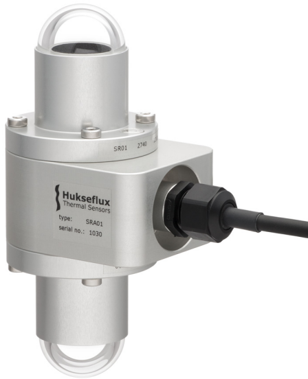
Figure 3 SRA01 second class albedometer, designed to fit a ¾ inch NPS mounting tube

SRA01 consists of two identical pyranometers model SR01, one facing up, one facing down. The albedometer body is designed to fit a ¾ inch NPS tube for mounting purposes. The cable can be led away through the tube (the tube's recommended outer diameter is < 28 \times 10^{-3} m, the inner diameter > 20 \times 10^{-3} m). Such a mounting tube is not part of the delivery. SRA01 can be ordered with longer cable and optional sun screens.