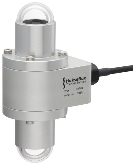
Figure 1 SRA01 second class albedometer

SRA01 albedometer is an instrument that measures global and reflected solar radiation and the solar albedo, or solar reflectance. It is composed of two identical second class pyranometers with thermopile sensors, the upfacing one measuring global solar radiation, the downfacing one measuring reflected solar radiation. SRA01 complies with the latest ISO and WMO standards.