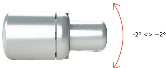
Figure 3 ALF01 albedometer levelling tool.

ALF01 is a levelling tool that can be used with AMF03 to easily level the instrument. The ALF01 is mounted on a 1 inch outer diameter crossarm, and can be rotated around the tube axis for 360 ° as well as tilted over \pm 2^\circ .