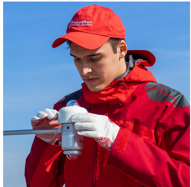
Figure 5 Using SRA30 albedometer is easy; the instrument is composed of AMF03 and two SR30-M2-D1 pyranometers.