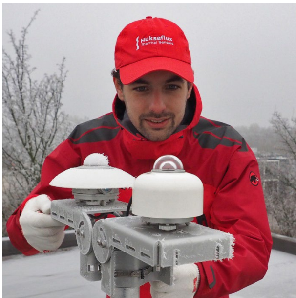
Figure 2 Frost and dew deposition: clear difference between a non-heated pyranometer (back) and SR30 with RVH™ technology (front).

High data availability is attained by heating of the outer dome using ventilation between the inner and outer dome. This space forms a closed circuit together with the instrument body; ventilated air is not in contact with ambient air. RVH™ - Recirculating Ventilation and Heating - technology, developed by Hukseflux, suppresses dew and frost deposition and is as effective as traditional ventilation systems, without the maintenance hassle and large footprint.