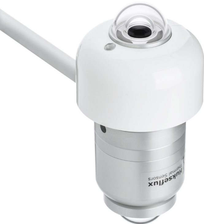
Figure 1 SRA30-M2-D1 albedometer.

SRA30-D1 digital spectrally flat Class A albedometer is an instrument that measures global and reflected solar radiation and the solar albedo, or solar reflectance. SRA30-M2-D1 is the most accurate albedometer available, and heated for the best data availability. It is composed of one AMF03 albedometer mounting kit and two SR30-M2-D1 spectrally flat Class A (previously "secondary standard") pyranometers. This pyranometer is compliant in its standard configuration with the requirements for Class A PV monitoring systems of the IEC 61724-1 standard. Each pyranometer has a thermopile sensor, the upfacing one measuring global solar radiation, the downfacing one measuring reflected solar radiation. AMF03 includes one glare screen, one mounting fixture with rod, mounting hardware and tools. SRA30 complies with the latest ISO and WMO standards. The modular design facilitates maintenance and calibration.