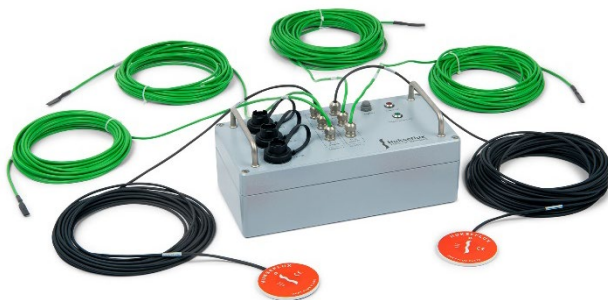
Figure 2 TRSYS20: example of a measuring system for thermal resistance of walls. It consists of 2 HFP01 heat flux sensors and 2 matched thermocouple pairs (in total 4 temperature sensors) connected to the measurement and control unit (MCU).