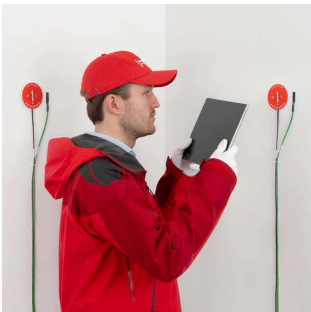
Figure 3 HFPO1 heat flux sensor and thermocouples mounted on a wall and measured with the TRSYS20 measuring system.

ISO 9869, ASTM C0146, and ASTM C1115 standards give detailed directions concerning the measurement method, sensor installation, and data analysis.