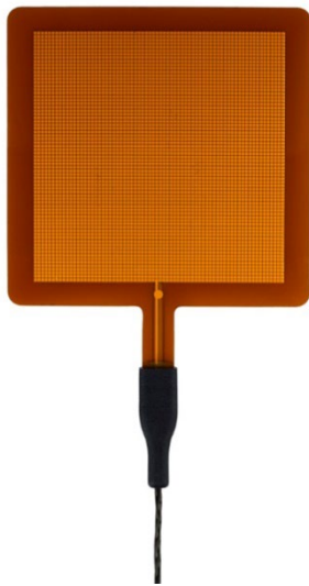
Figure 1 Model FHF05-85X85 heat flux is most suited for measuring on windows. All models of FHF05 series have a low very thermal resistance.

Thermal insulation of windows may be tested the same way as that of walls; however, some specific points need attention. First, testing should be done in the dark, for instance working at night only, because windows transmit light. Second, the thermal resistance of windows is typically smaller than that of walls, thus the thermal resistance of heat flux sensors mounted on the window creates a significant error. This error is called the resistance error and must be corrected. Hukseflux sensor model FHF05-85X85 is most suited for testing windows. The sensor is very sensitive and capable of measuring low heat flux levels. It has a low thermal resistance resulting in a low resistance error. This reduces the uncertainty of corrections.